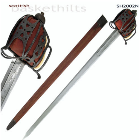
Above (Photo1) Reproduction (Hanwei) Scottish Broadsword.