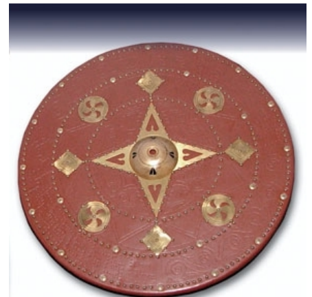
Above (Photo 3) Reproduction Scottish Targe.