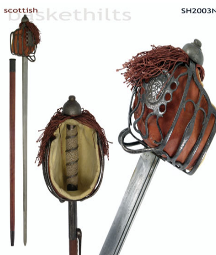
Above (Photo 2) Reproduction (Hanwei) Scottish Backsword.